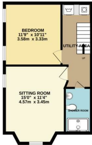
BASEMENT LEVEL 417 sq.ft. (38.8 sq.m.) approx.