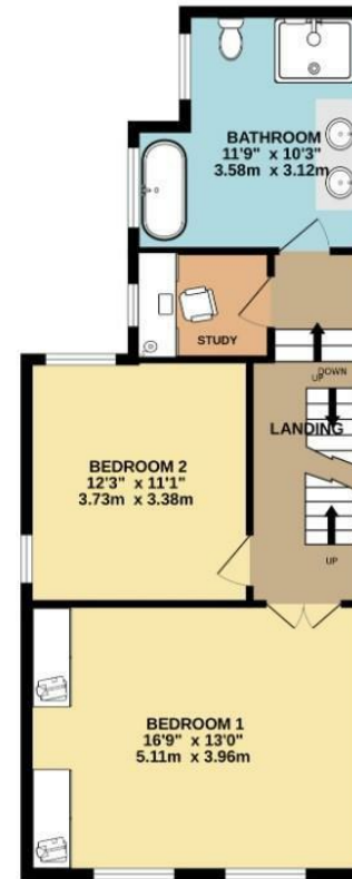
1ST FLOOR 612 sq.ft. (56.9 sq.m.) approx.